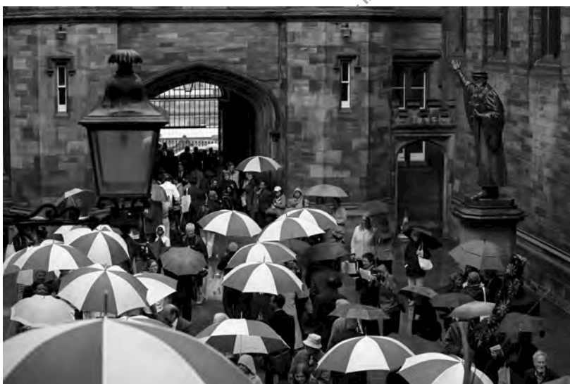
Delegates leave the Assembly Hall after the closing celebration past the statue of John Knox in New College, University of Edinburgh