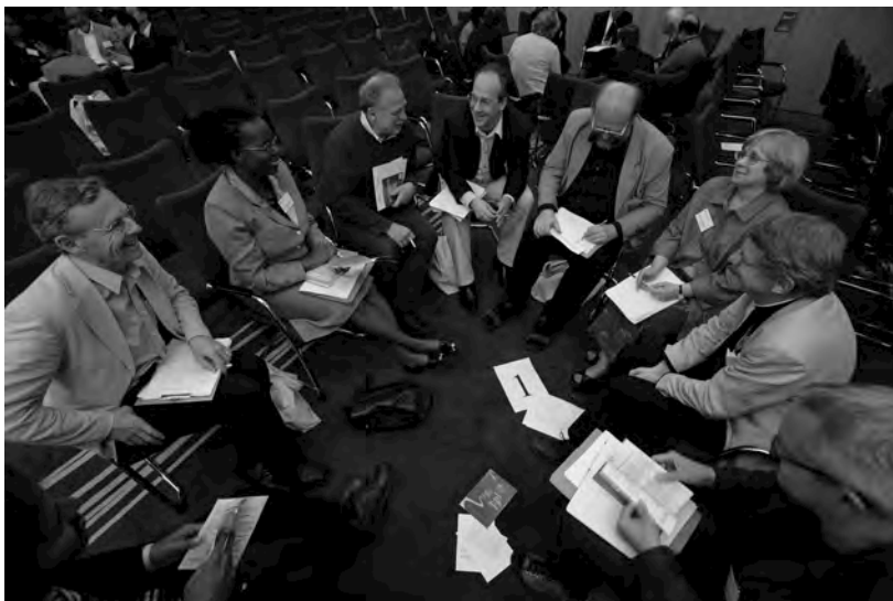
Small group during the parallel session on Theme 6: Theological Education and Formation