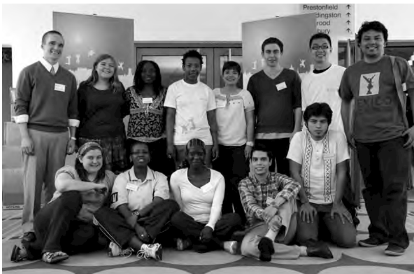
The youth delegation