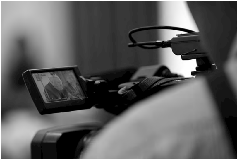
TV camera records the press conference: The Most Reverend Brian Farrell on screen