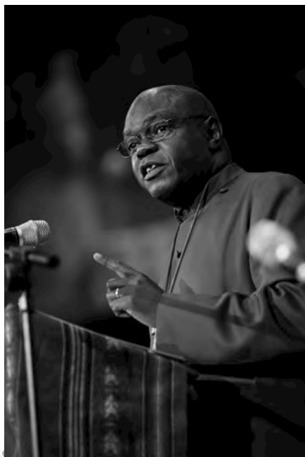
Archbishop John Sentamu speaks at the closing celebration.