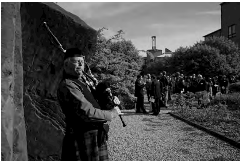
A piper welcomes the delegates to the opening worship at the Edinburgh 2010 conference