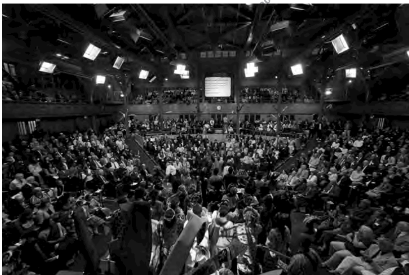
The congregation enjoy the sound of the Scotland African Mass Choir at the closing celebration in the Church of Scotland Assembly Hall, venue for the 1910 World Missionary Conference